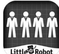
Operation Math Code Squad £2.99 (iOS) £2.69 (Google)